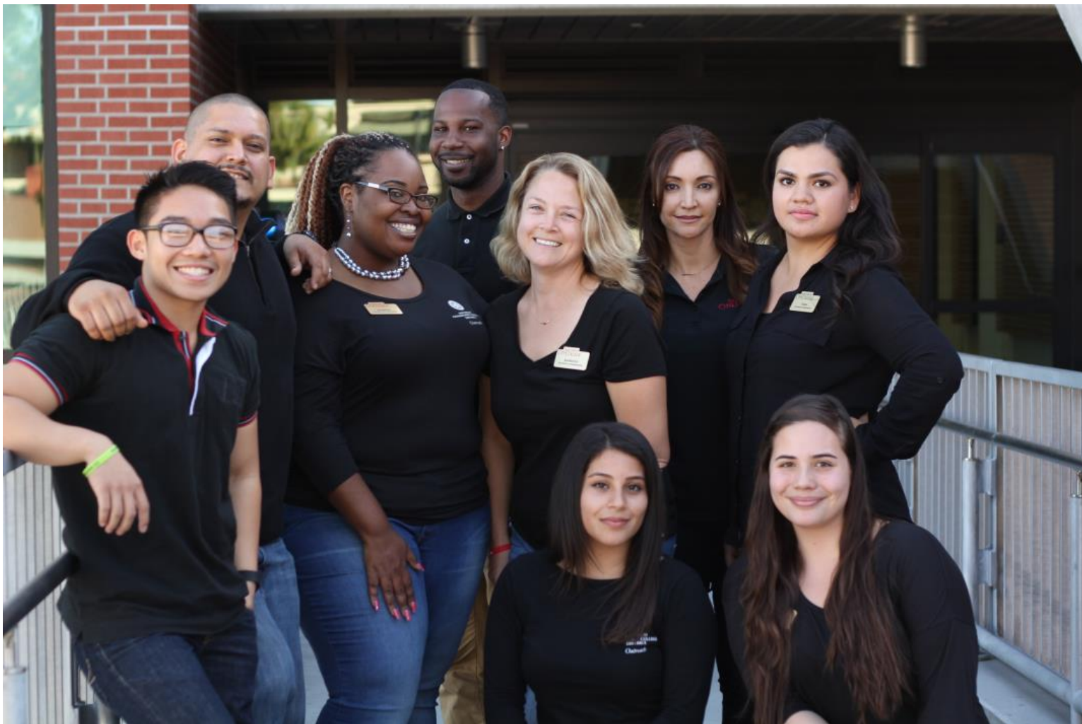
Our OUTREACH team!